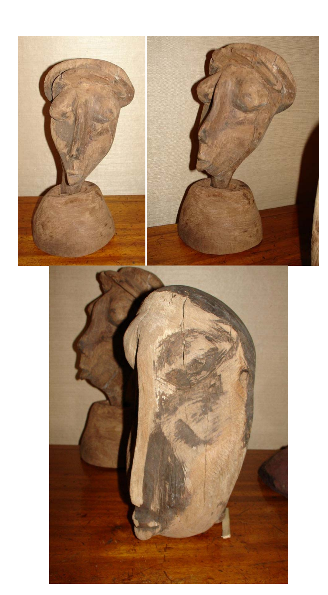
The bronze can be seen on http://www.sithole.com/SITHOLE-LS7003.htm#LS7003.3