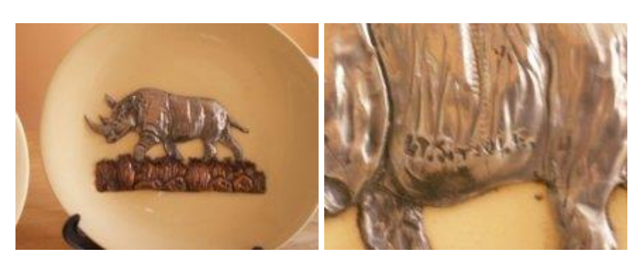
In private collection, Salt Lake City, Utah USA