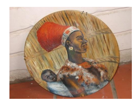
In private collection, Pretoria – painted on wooden plate – \emptyset 31 cm