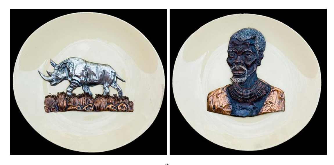
Sold on auction at Bernardi Auctioneers, Pretoria – 9^{th} November, 2009 – Lots 711 + 712 as Transitional Art

A list showing items ATTRIBUTED to Lucas SITHOLE, of a doubtful nature or actual fakes can be seen on: